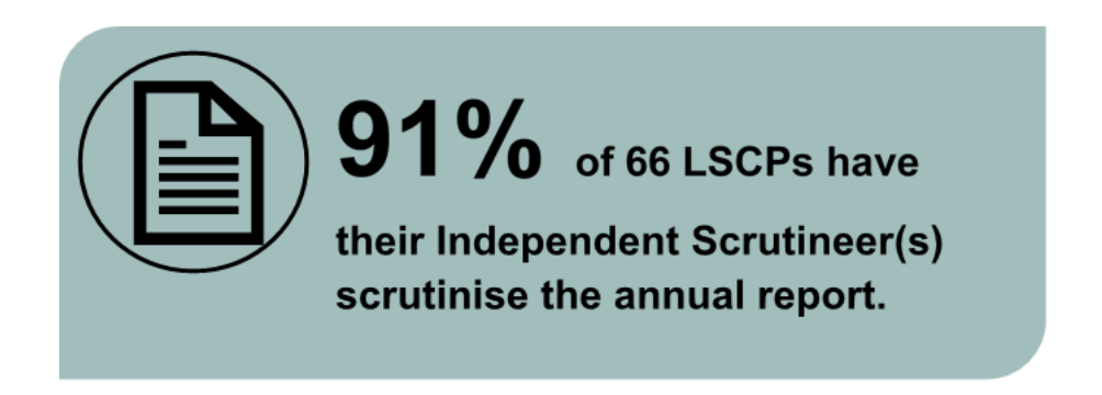
Figure 5 - Independent Scrutineer(s) scrutinising the annual report

17. The extent to which scrutiny focuses on holding LSCP executive leadership to account can vary. It includes feedback to LSCP leadership to drive improvements; taking a leadership role themselves as Scrutineers to drive forward change; and scrutinising LSCP budget allocation and reviewing budget use. 91% of 66 LSCPs noted that scrutineers scrutinise the content of the annual report and add a scrutiny findings section into the annual report.