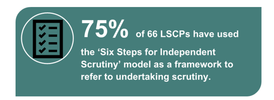
Figure 6 – Number of LSCPs using used the Six Steps in scrutiny